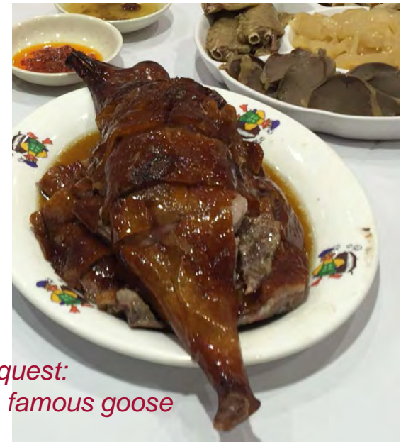
Special request: to try HK's famous goose