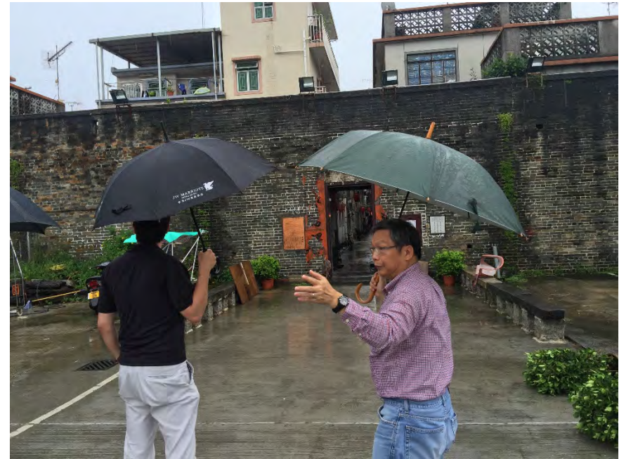
Historic Tour of New Territories village