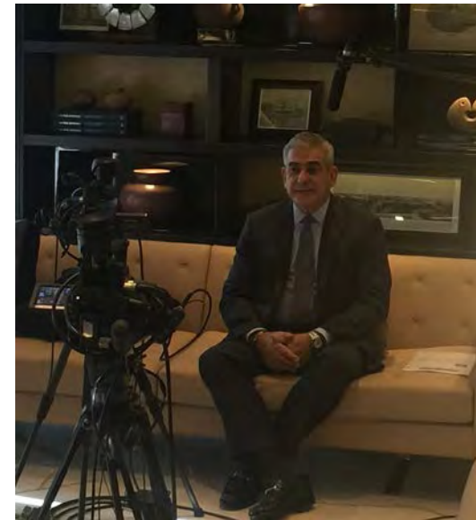
Jamie Ayala, Chairman & CEO, Ayala Corporation