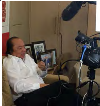
Dato Sri Tahir, Mayapada Group founder