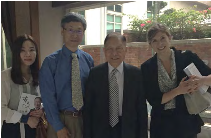
Mochtar Riady, Lippp Group founder