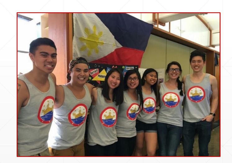
Members of the Harvard Philippine Forum