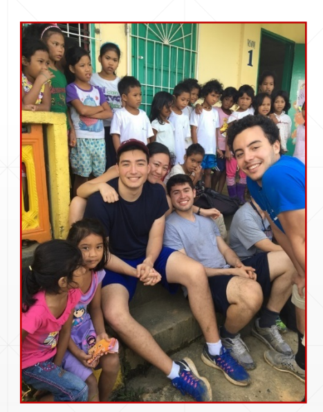
Harvard students working with ChildHope Philippines, January 2017

Philippines: FAS Workshop on Potential Collaborations with the Philippines (March 2017) – Inspired by the 2016 HAA Clubs/SIGs meeting in Manila