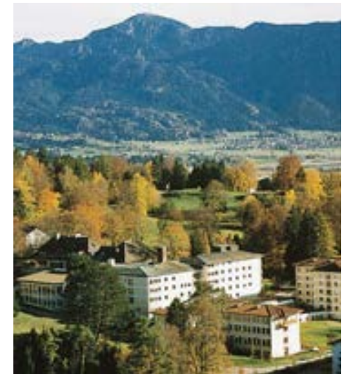
Children's Hospital Hochried, Murnau, former James Loeb residence