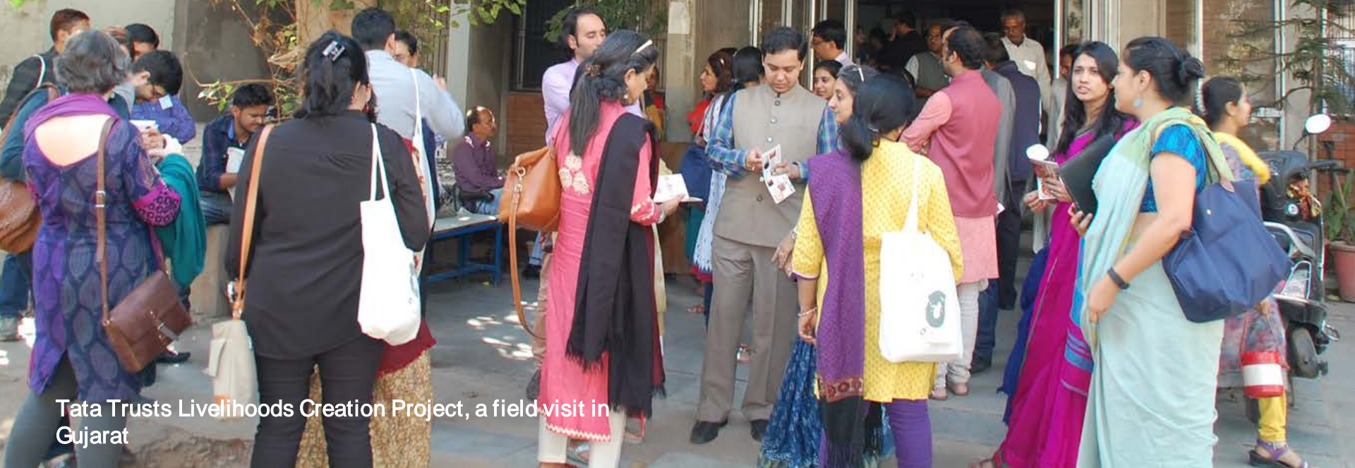
Tata Trusts Livelihoods Creation Project, a field visit in Gujarat