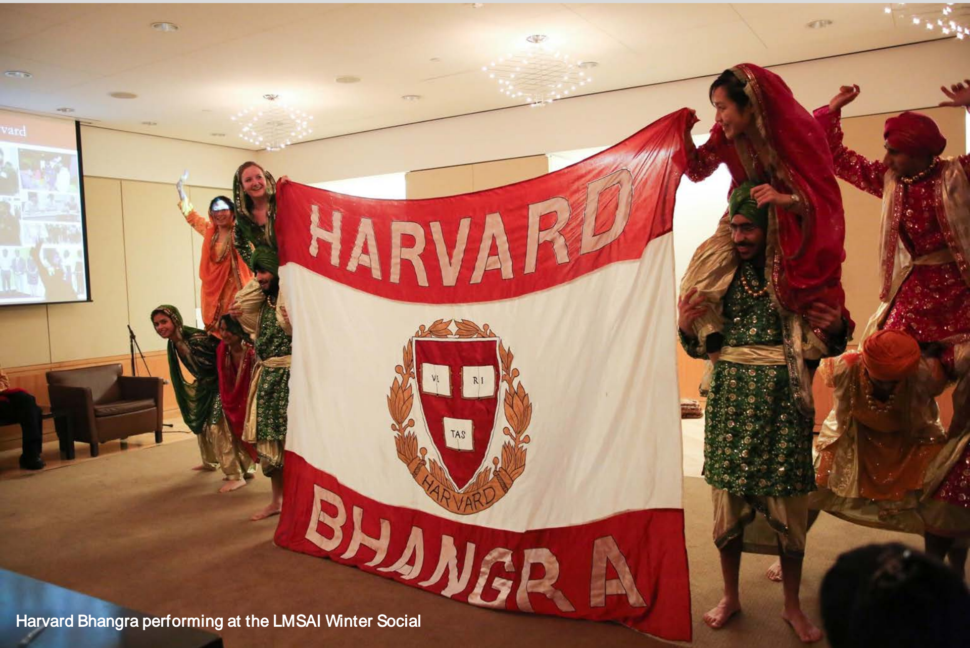
Harvard Bhangra performing at the LMSAI Winter Social