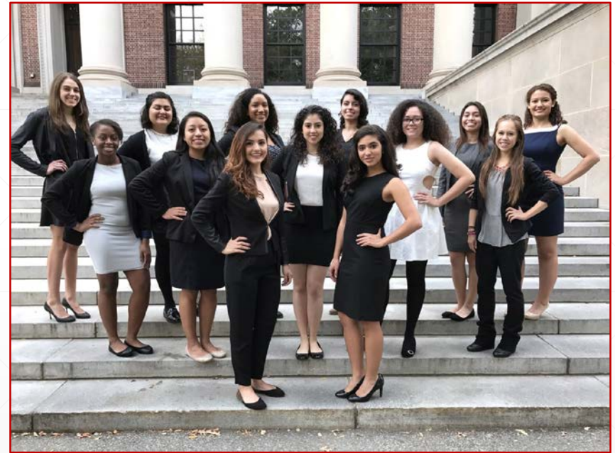
Student Organizers of LEAD 2017